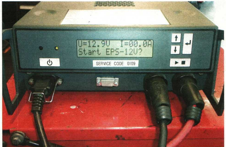
Above: The backup power supply we use to ensure that volatile memory is retained whenever battery disconnection is required. If, however, airbag/POSIP/MRS systems require work, the car must be powered down with no backup power to ensure safety when handling explosive components. Afterwards, the car's volatile memory must be reestablished.

Additionally, problems are more likely if a control unit or system in your 911 already had some underlying issue(s) prior to battery disconnection. To eliminate this problem altogether, we recommend utiliz-