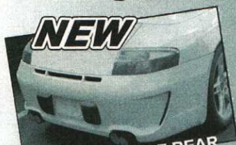
GT3 RS 2010 STYLE REAR BUMPER FOR 1999-2004 996