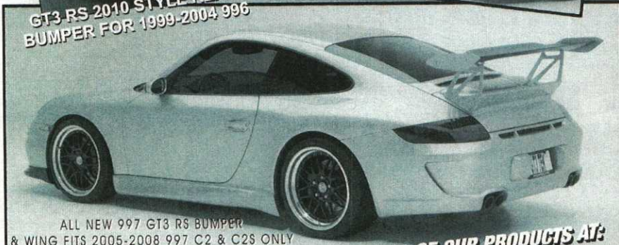
ALL NEW 997 GT3 RS BUMPER & WING FITS 2005-2008 997 C2 & C2S ONLY

SEE ALL OF OUR PRODUCTS AT: RENNSPORT REUNION IV OCT. 14, 15, 16 AT LAGUNA SECA