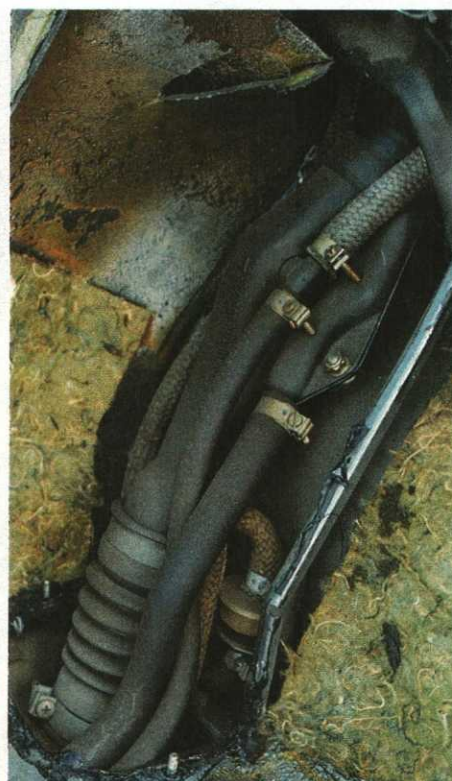
Gasoline can pool around the fuel-level sending unit (left), making the interior smell, but vent hoses in the rear storage area on the passenger side "hump" are the most likely source of gasoline fumes inside a 924/944/968. Remove the carpeting and the cover panel to access the hoses.